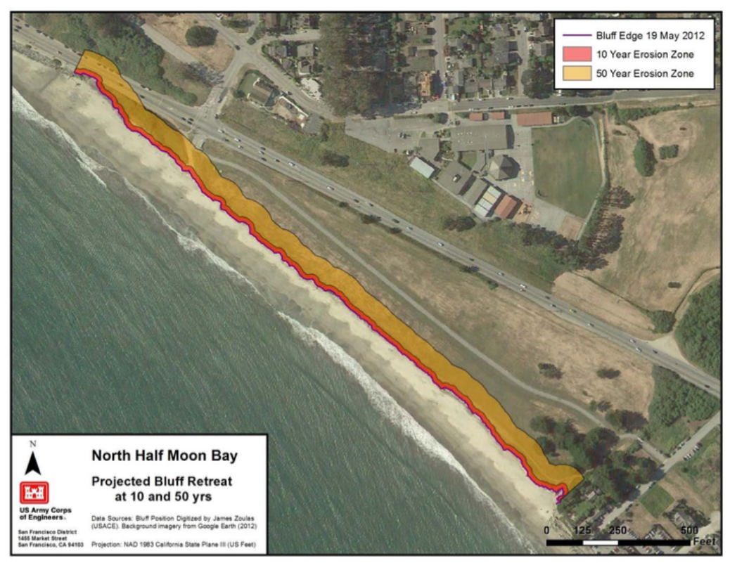
Figure 3: Extent of Projected Bluff Retreat at 10 and 50 Years (based on the estimated retreat rate of 1.64 ft/yr)