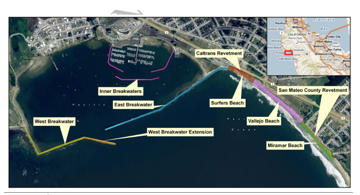
Figure 2: Study Vicinity